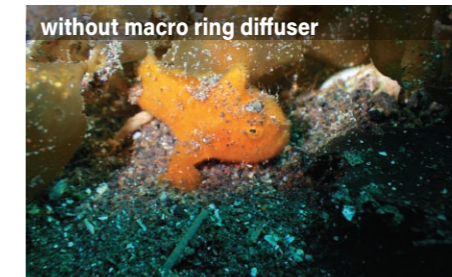
without macro ring diffuser