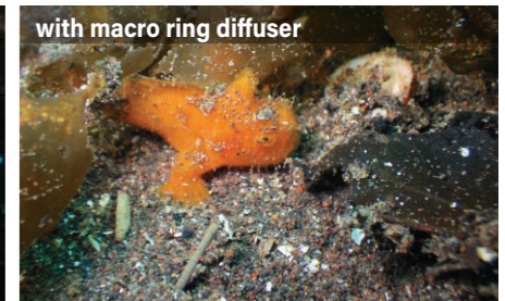
with macro ring diffuser