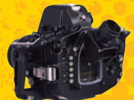
With the VF45 1.2x mounted