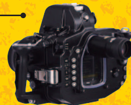
With the VF180 1.2x mounted

▶ Compatible with both the VF180 1.2x and VF45 1.2x viewfinders